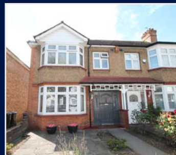
Kenmare Gardens, N13 SOLD £568,000