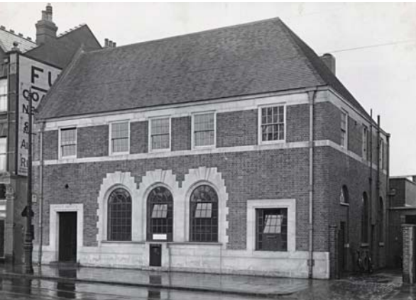
The new Post Office was formally opened on 1 January 1932.

Content sourced from www.thenewwiperstimes.com/2019/02/11/palmersgreenpostoffice/ and, Once upon a time in Palmers Green by Alan Dumayne.