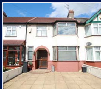
Munster Gardens, N13 SOLD 520,000