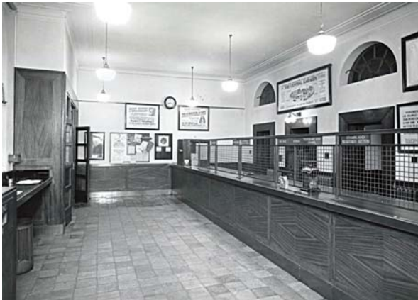
None of its original internal features remain today.