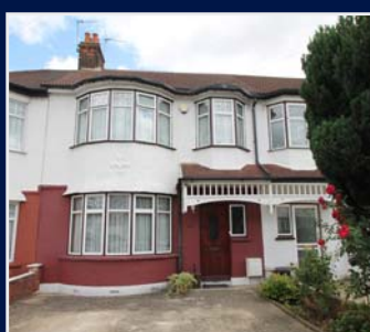
Madeira Road, n13 SOLD £567,500