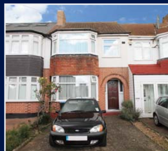
Rayleigh Road, N13 SOLD £439,995