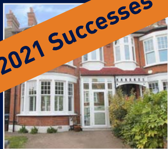
The Grove, N13 SOLD £738,000