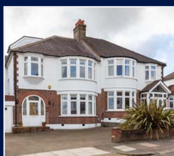
Brackendale, N21 SOLD £1,110,000