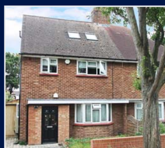
Frandale Avenue, N13 SOLD £580,000