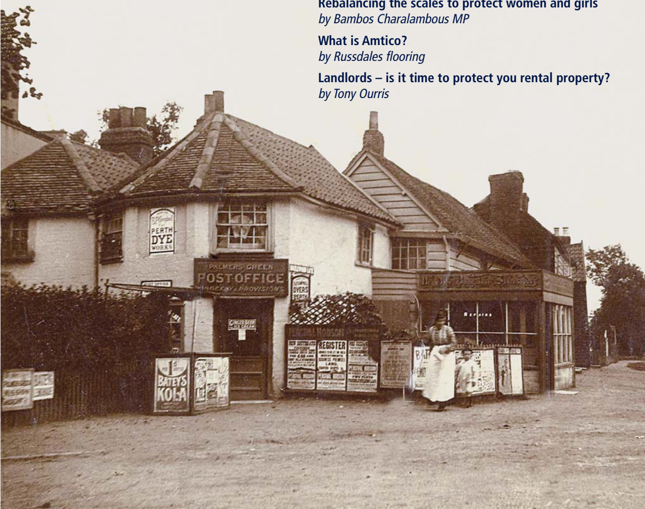
Palmers Green Post Office circa 1890

Landlords – is it time to protect you rental property? by Tony Ourris