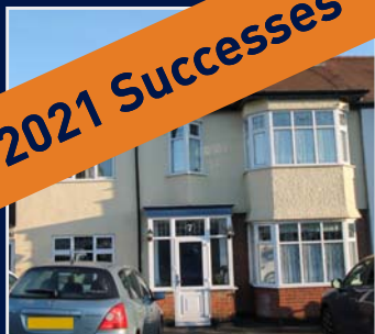
Franlaw Crescent, N13 SOLD £680,000