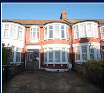
Berkshire Gardens, N13 SOLD £598,000