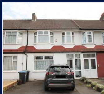
Princes Avenue, N13 SOLD £505,000