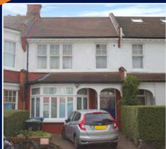
Woodberry Avenue, N21, Under Offer Asking Price £325,000 (First floor flat)