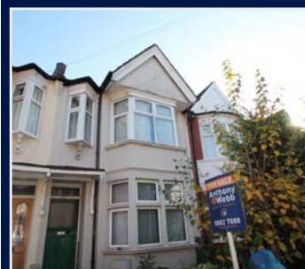
New River Crescent, N13 SOLD £610,000