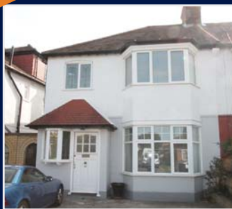
River Avenue, N13 SOLD £775,000