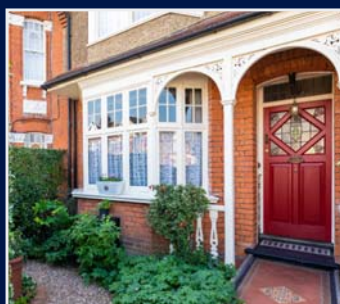
Park Avenue, N13 SOLD £735,000