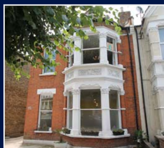
Palmerston Crescent, N13 SOLD £752,750