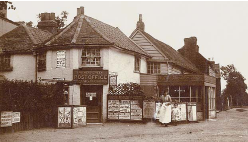
Palmers Green Post Office circa 1890, on the corner of Hazelwood Lane and Green Lanes

In the early years of Palmers Green village, a small charming two-story cottage stood on the corner of Hazelwood Lane and Green Lanes. Established in 1864, it served as the Post Office and General Store with its attractive pantiled roof, splayed corner entrance, and billboards usually propped up against the white picket fence.