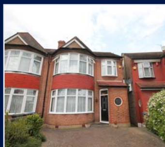
Connaught Gardens, N13 SOLD £580,000