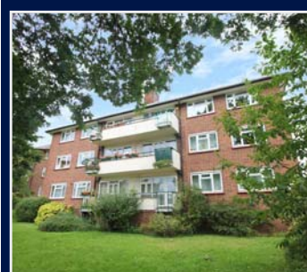
Hertford Court, N13 SOLD £405,000 (2 bed flat)