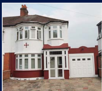
Wentworth Gardens, N13 SOLD £719,000