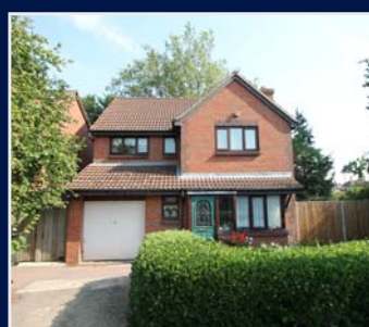
Crothall Close, N13 SOLD £700,000