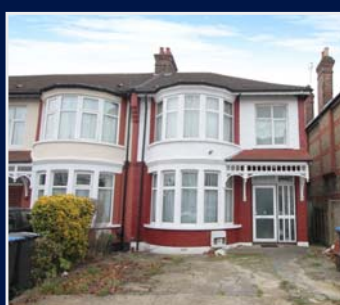
Riverway, N13 SOLD £685,000