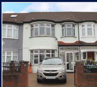
Madeira Road, N13 SOLD £605,000