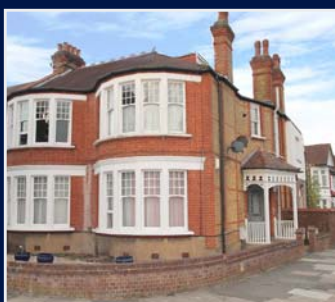
The Grove, N13 SOLD £325,000 (1 bed flat)