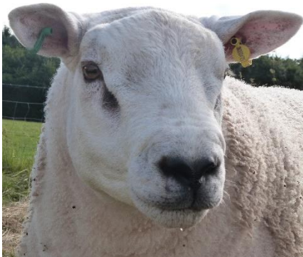
(27 Shearling Rams)