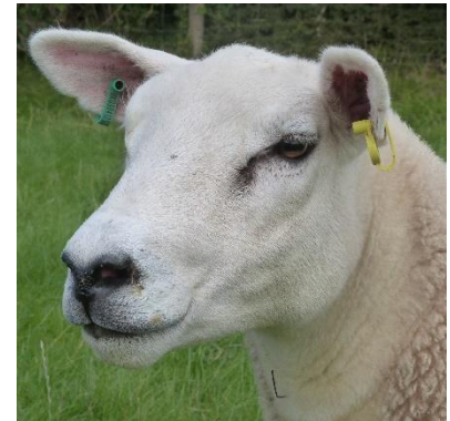
(15 Pedigree Ewes)