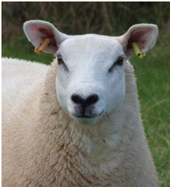
(17 Birth Registered Ewe Lambs)