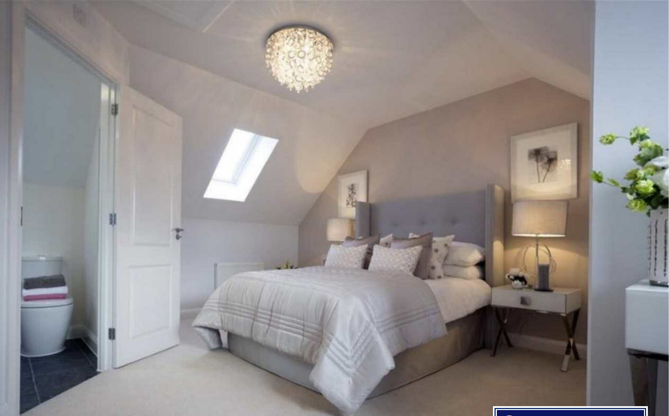
The Holt, Plot 43 The Holt, Plot 43, Corsham, SN13 9GT